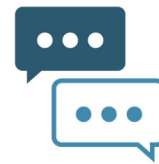
Counseling on topics such as quitting smoking, losing weight, treating depression and reducing alcohol use