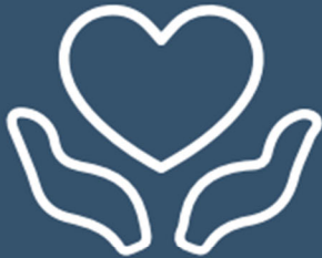
Preventive care and screenings

Primary care is meant to be your main point for health care services, addressing most of your health needs throughout your lifetime. For that reason, primary care incorporates several different kinds of health care services, including: