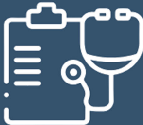
Acute care diagnosis and treatment