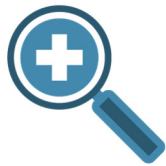
Screenings (e.g., mammograms and colonoscopies)