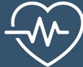
Chronic condition care